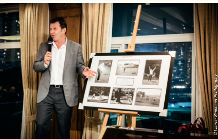
Nick recalling his six Majors