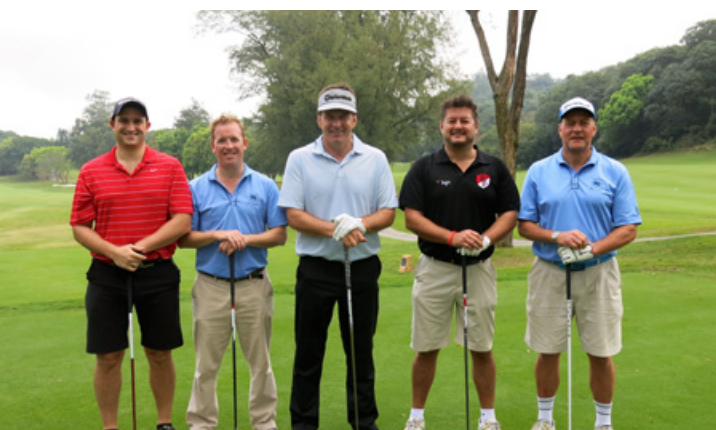
Faldo Five Ball (L to R):

Presented in partnership with Mission Hills and supported by Hong Kong Golf Club