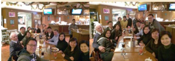
Photos from the Christmas Gathering