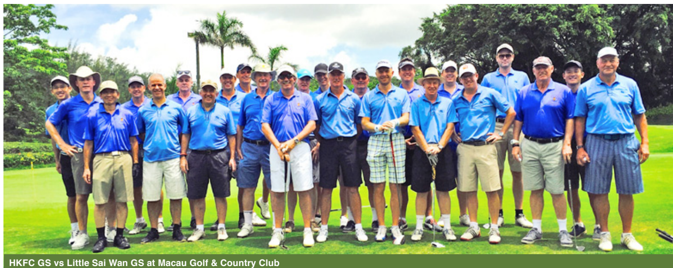
HKFC GS vs Little Sai Wan GS at Macau Golf &amp; Country Club

Glover. Nick was in redoubtable form whilst Will struggled for consistency and so the overall scored moved on to 3 - 1.